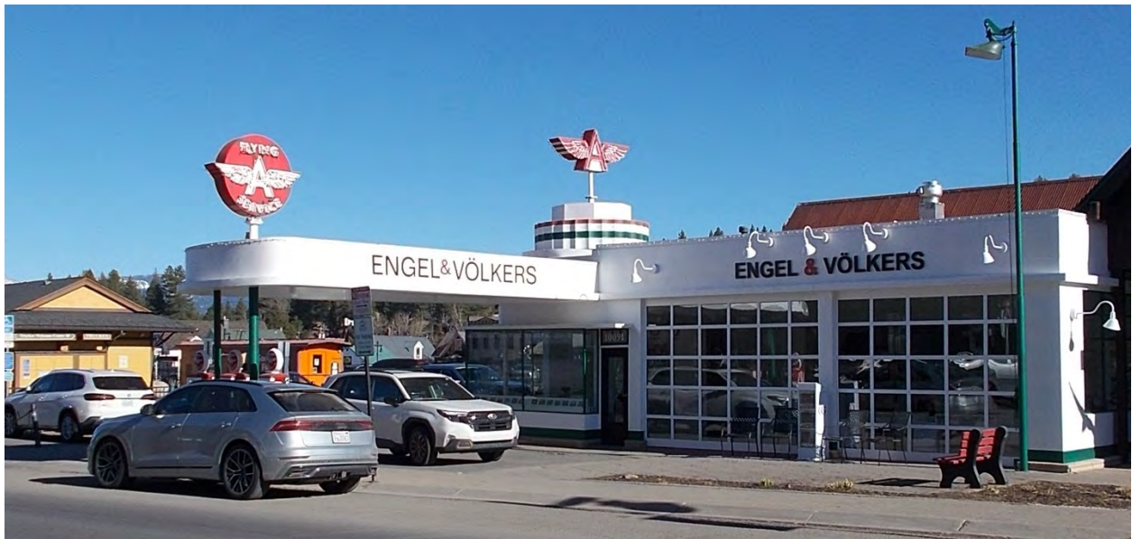
Engel & Völkers, Truckee (DSCN9097.JPG).

Motions and votes are given in italics ; action items are in red bold . For various reasons, the minutes below do not reflect the strict chronological order of discussions during the meeting.