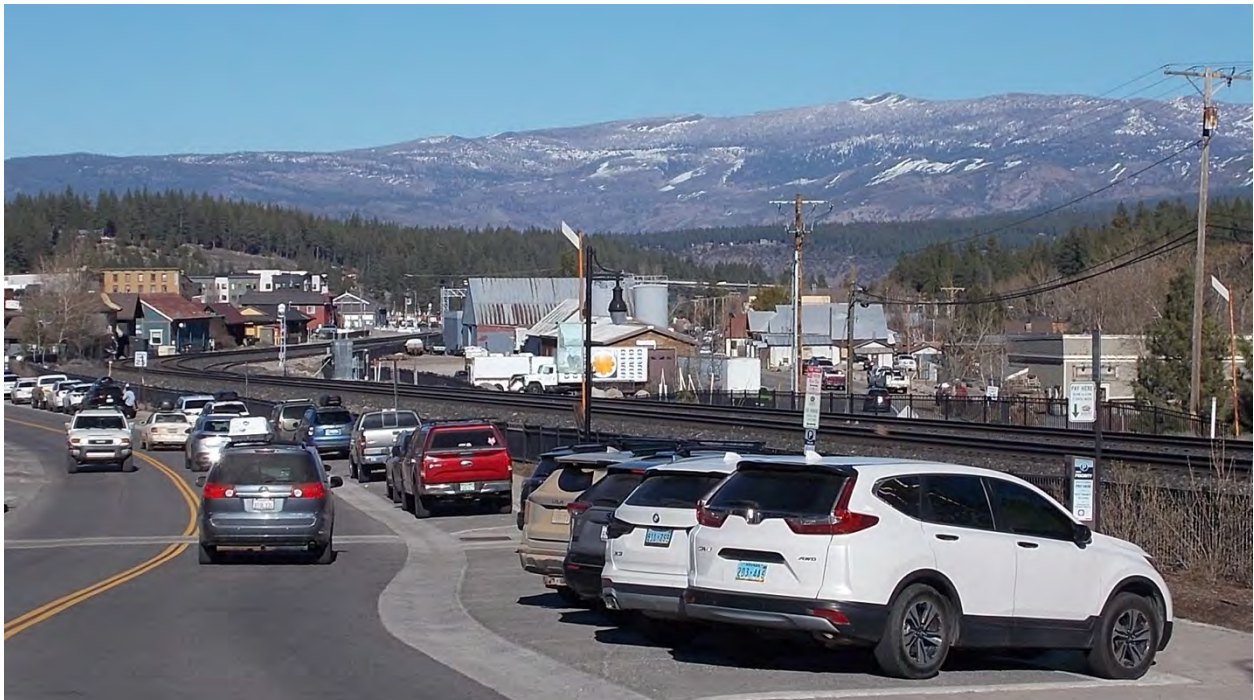
Downtown Truckee on a warm March afternoon (DSCN9096.JPG).